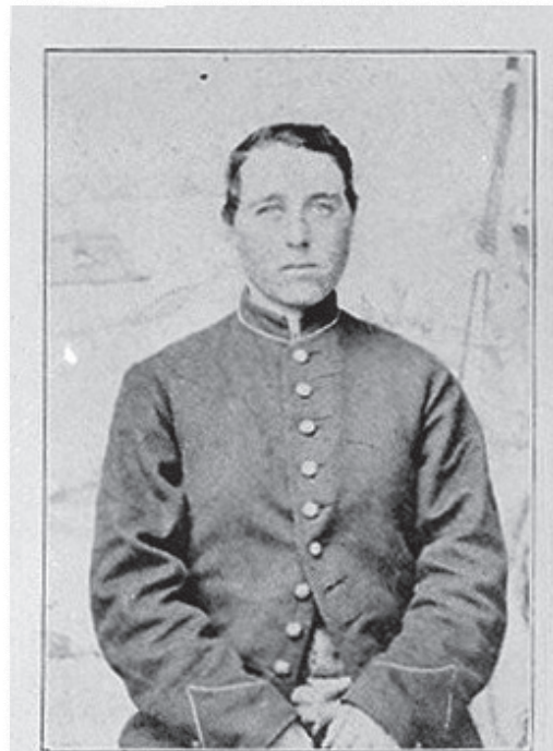
ALBERT D. J. CASHIER OF COMPANY G, 95TH ILLINOIS REGIMENT